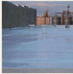
2. Prime surface with Tack Coat Single-Ply membrane primer.