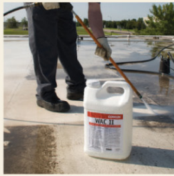
1. Power wash and clean with Wac II Roof Cleaner